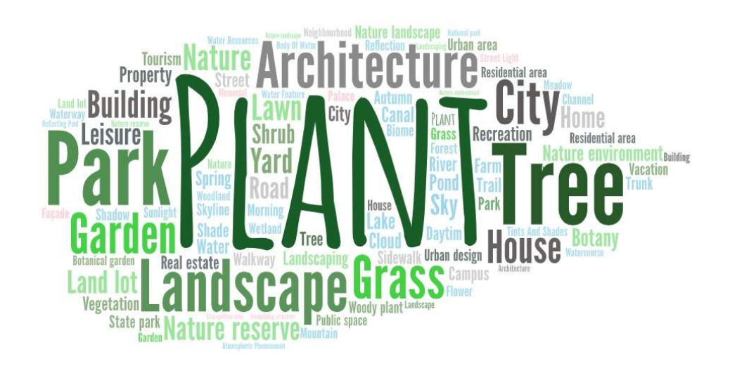
Figure 3 The most frequent labels extracted from Google Vision AI, illustrated by WordArt.com.

Figure 2 Using Google Vision AI, the study extracted labels from natural environments in the urban green space that were used as independent variables. (Retrieved from <u>https://cloud.google.com/vision</u>).